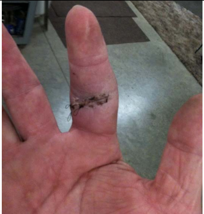
Randy was lucky not to lose a finger in a wire wheel

A grinder, wire wheel, or buffing wheel can grab the work-piece you are holding, spin it around, and throw it at you in a tiny fraction of a second, too fast for your to say “Oh snot!” Many bad things can happen next. The work-piece can hit your finger and mercilessly cut your skin and bone, hit you in the face, or in a worse place, if you catch my drift. The wheel can also grab your clothing or hair and pull you into to its rotating hell. When something like this happens you better hope that the wheel is mounted on a ¼ horsepower motor and not a bigger one, because it helps if you can stop the motor before your limb, face, or hair is consumed. Pay attention, wear face protection, don't wear loose clothing, stow long hair and beards.