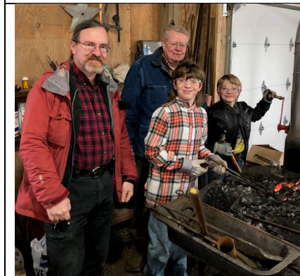
Three generations of smiths!