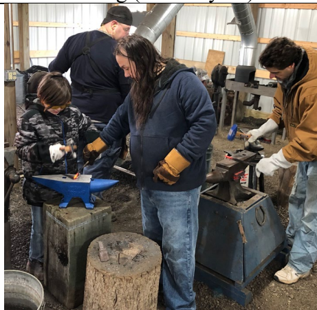
Lots of activity.