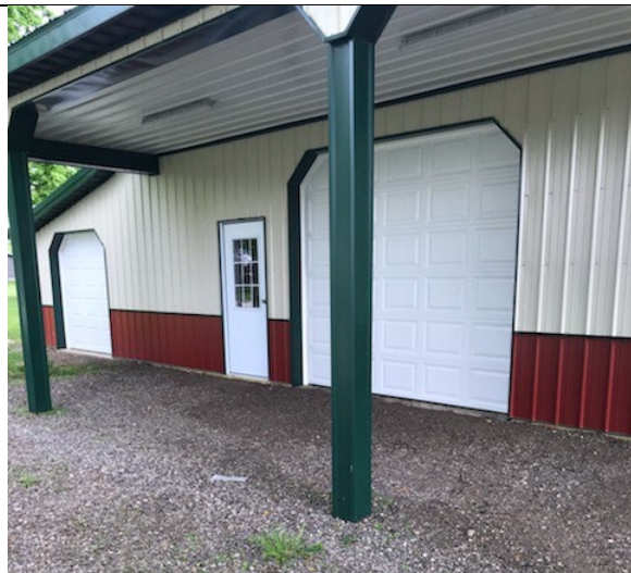
All the doors are installed at the Illiana shop. This photo shows the porch at the front entrance.