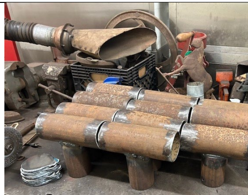
Cleaned up pipes for ten more ash dumps await welding.