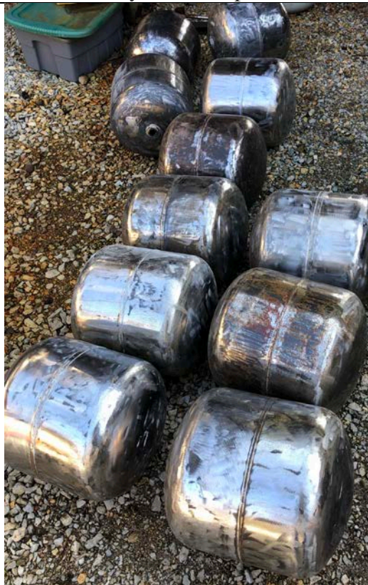
25 propane tanks cleaned up