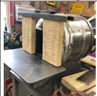
First one almost finished!