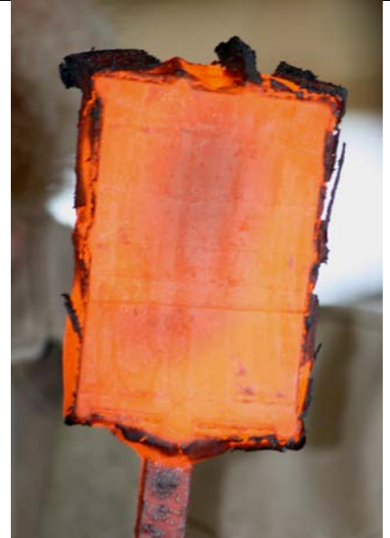
Dark region is bad weld.