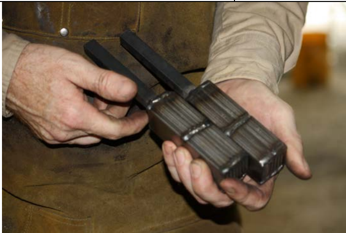
Start is layered steel tack welded with a stem.