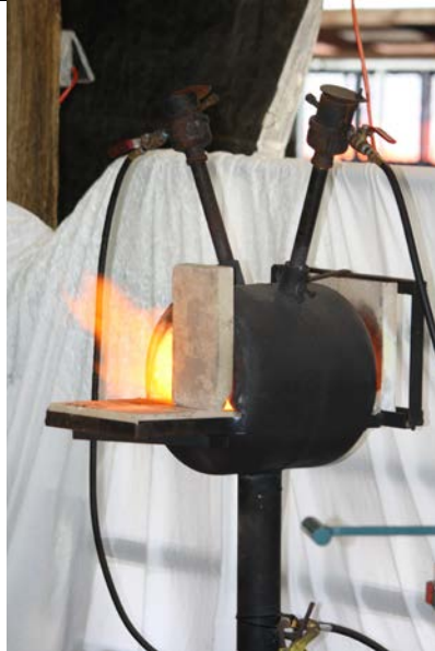
5-6 inches of dragon’s breath.