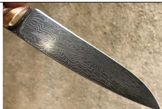
Finished produce, Damascus knife.