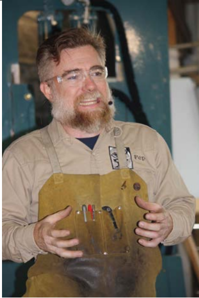
Pep’s dynamic speaking style.