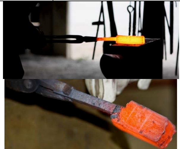
Metal forge welded and being worked on anvil.