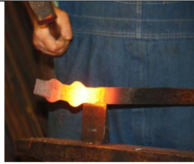
Cutting the piece from the stock.