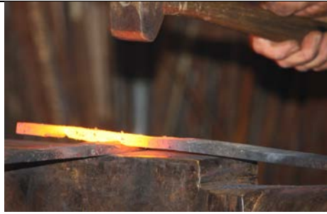
Forming the indentions for the eye.