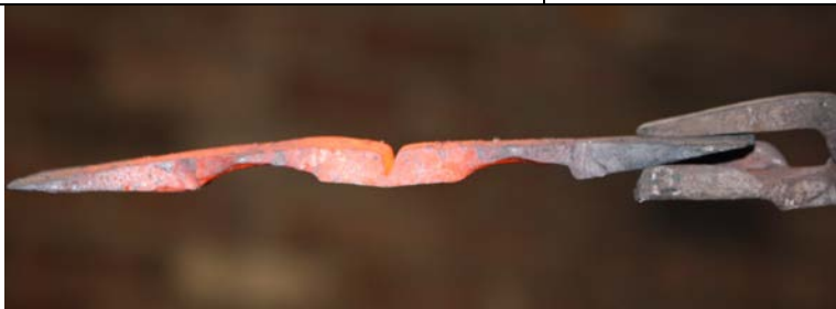
The hatchet head prior to the folding (edge view).