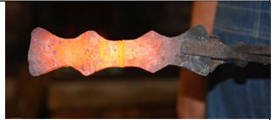
The hatchet head prior to the folding (side view).