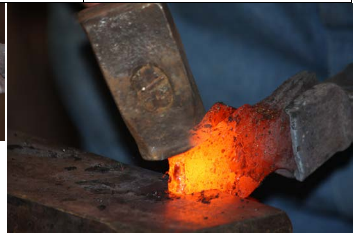
Forge welding the front.