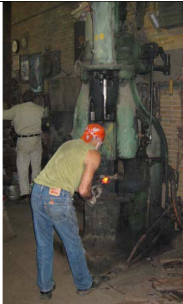
And another monster!