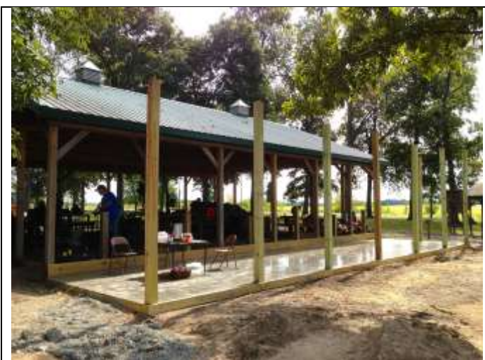
The west-end addition to our building in Rainsville that will house an early 20 th century machine shop featuring early American trades.