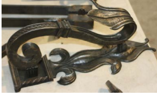
Delicate shapes by Clay Spencer