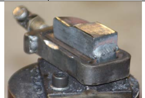
Power Hammer tooling by Clay S.