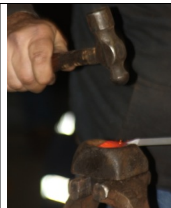
Shaping in a rose mold.