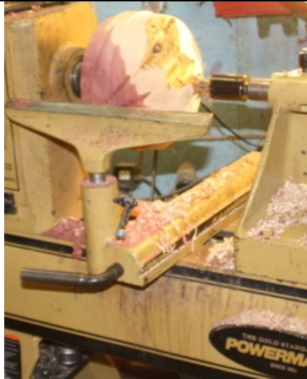
Rough shaping on wood lathe is done with a roughing gouge.