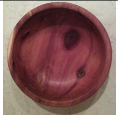
Dominick's finished cedar bowl (8.5 in dia.). Very cool!