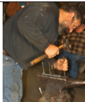
Adding veins on the anvil with a chisel.