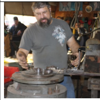
Production work (for $) is helped with a bender.