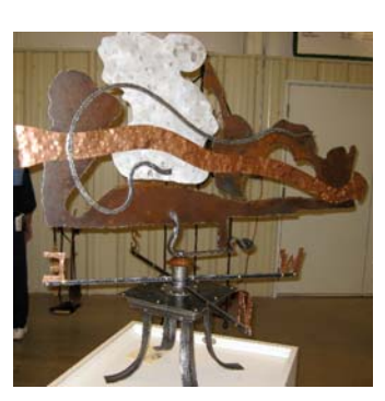
A modern weathervane displayed in the gallery.