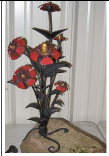
Floral arrangement made from forged iron.