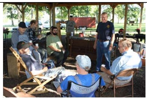
Rocky Smiths have fun chatting at July meeting.

The Rocky Forge group met the second Saturday of July to prepare for the Iliana Steam and Power Show the next weekend.