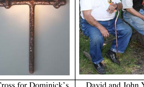
Cross for Dominick's mother-in-law.