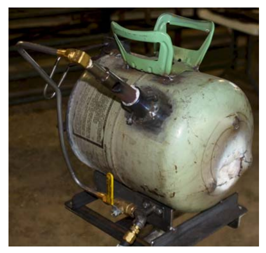
Simple gas forge at IBA Conference

http://www.abana.org/downloads/pipeforge_plans.pdf http://www.arscives.com/bladesign/forge.tutorial.htm http://www.cyphertext.net/~gfish/forge.html http://www.zoellerforge.com/sidearm.html