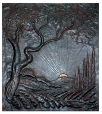
This repousse piece in the gallery was fantastic.