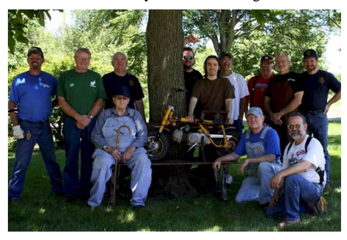
Happy smiths and the scooter before dissection.

and a report published showing the results. I am looking forward to see the creativity that comes from this project. A good book that shows what the African blacksmiths make from junk vehicles is "The Mande Blacksmiths Knowledge, Power and Art in West Africa" by Patrick McNaughton. Ted