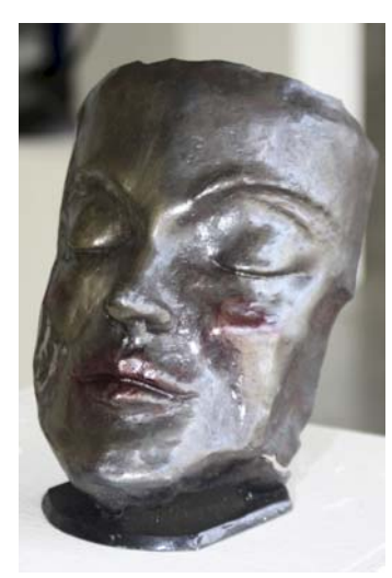
A forged face in the ABANA Gallery