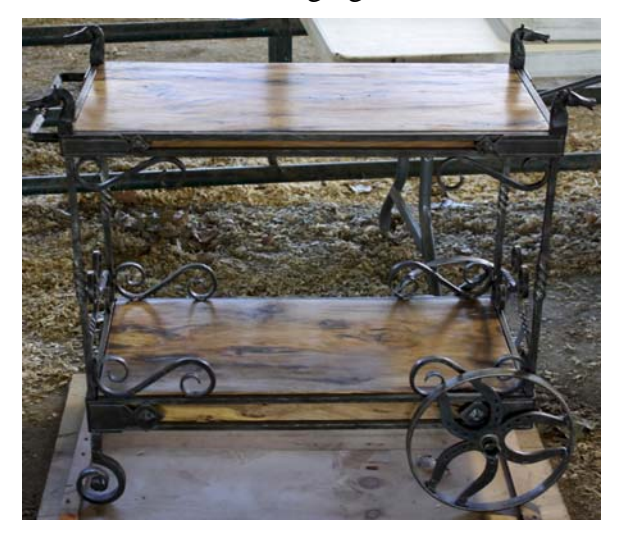
Winning table made by the Vernon group.

table made by the Vernon group (Jennings County Historical Society Blacksmith Shop). It was also the hit of the auction, bringing in over $2000.