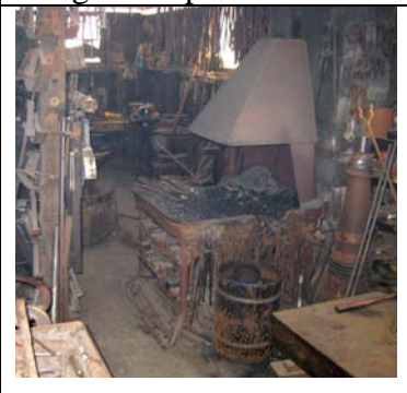
Forge from the right side.