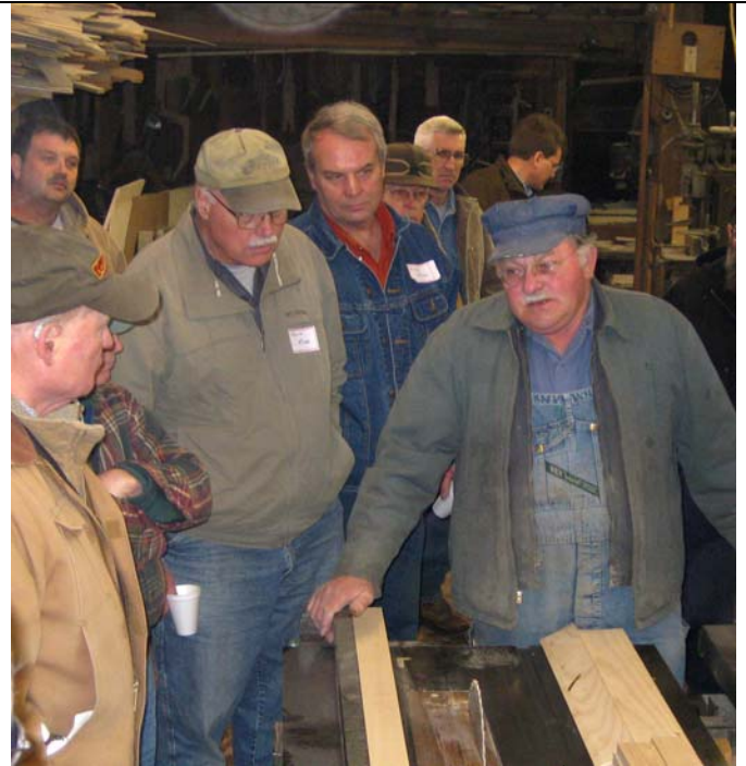
Many power tools from the early 20 th century.