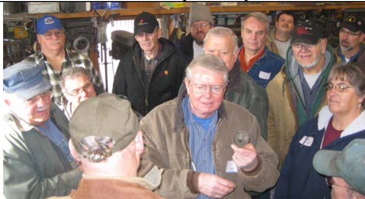
A robust discussion about some obscure tool.