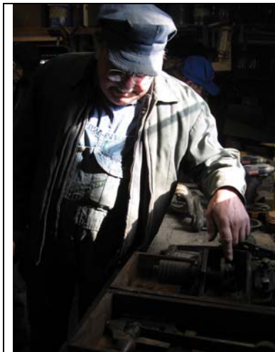
Drawer with wood tools.