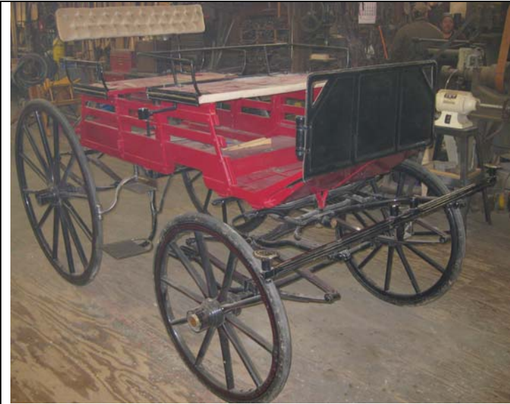
A coach in the shop to be reproduced.