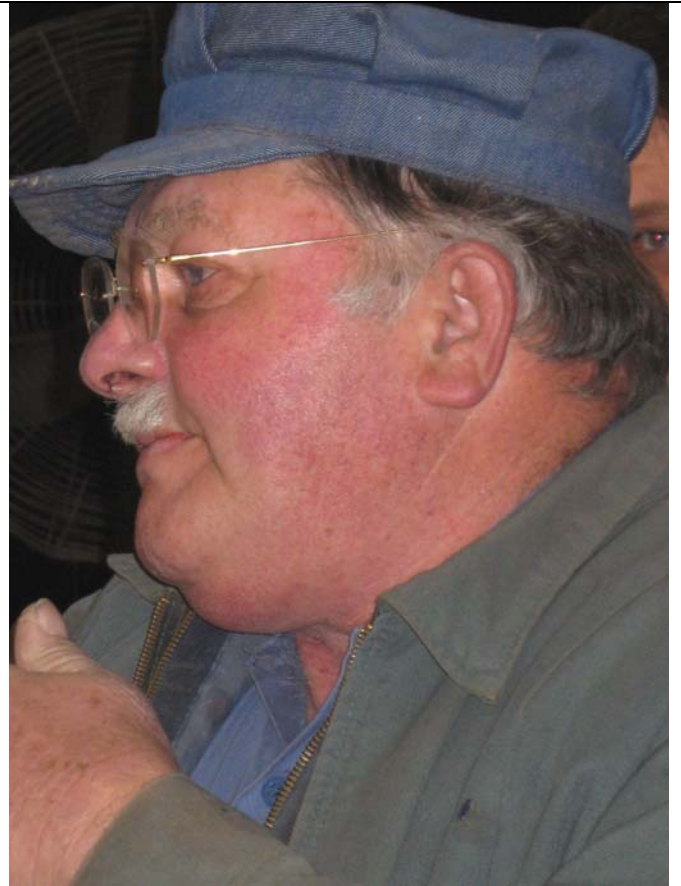
This man knows his coaches!