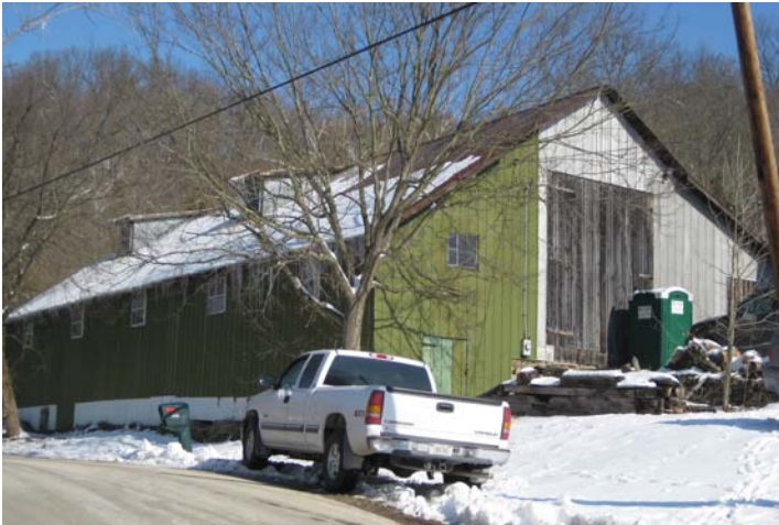
The main Coach Shop from the picturesque street.