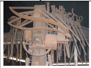
Tongs and special tools