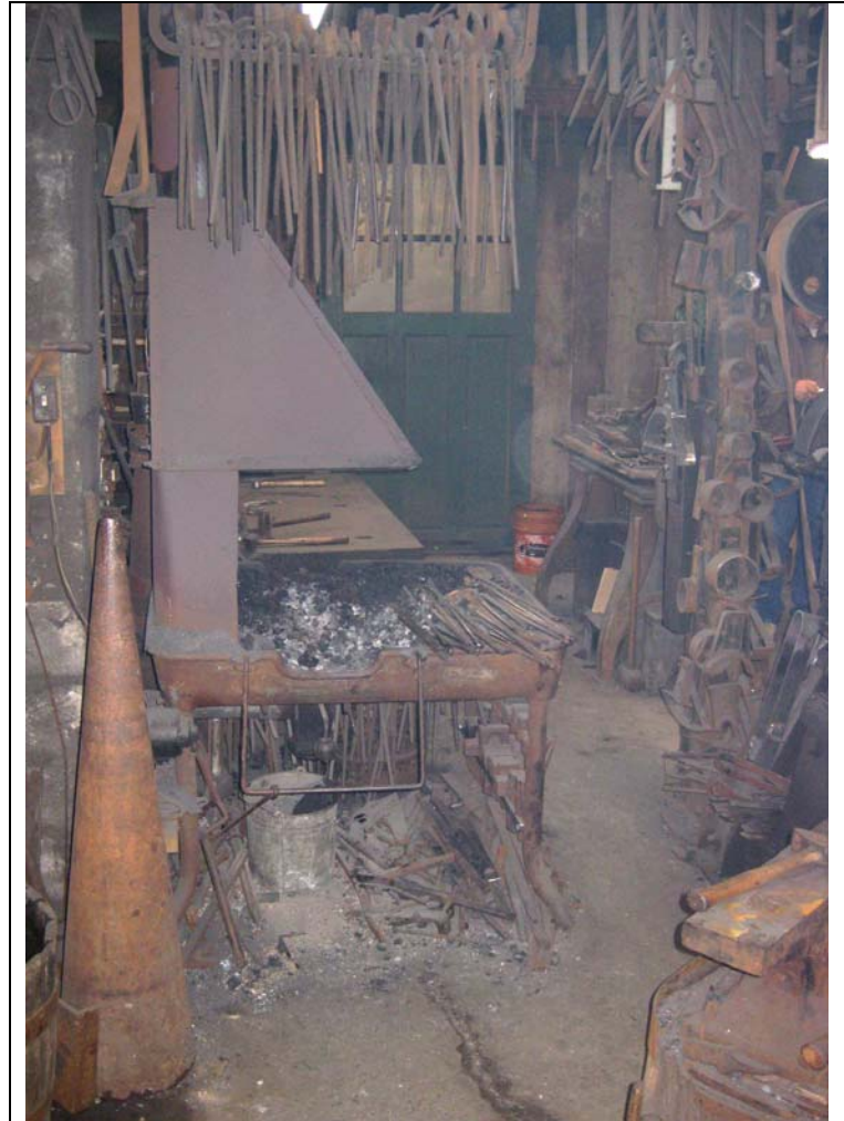
Adjoining blacksmith shop