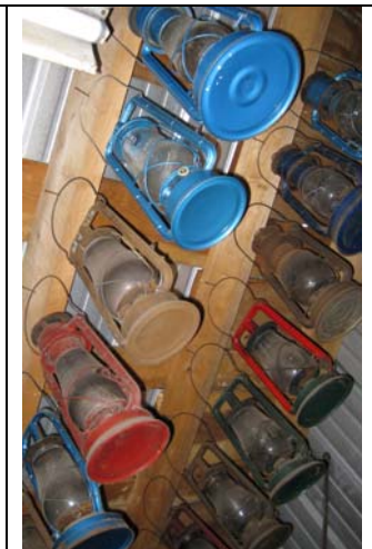
A few lanterns