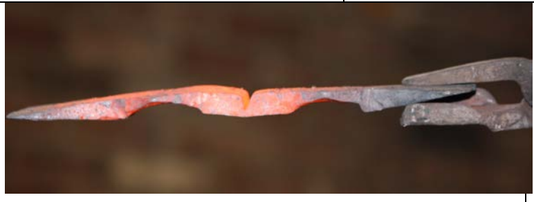
The hatchet head prior to the folding (edge view).