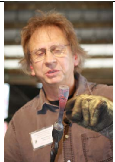
Second step: Drawing out the stem