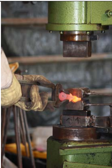
Refining the ball