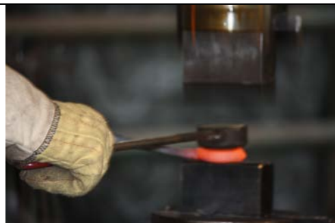
Third step: Crushing the ball into circle