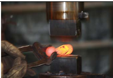
Drawing out on power hammer