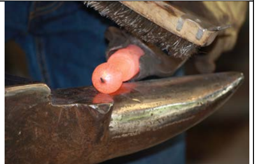
Ball partially made