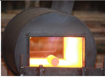
Start: Solid cylinder in gas forge