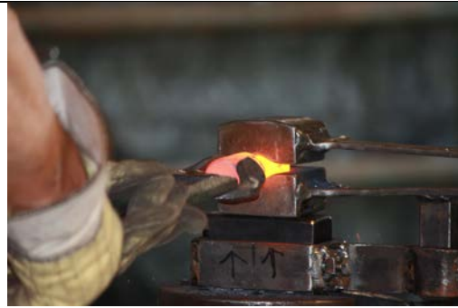
Die in power hammer to make ball