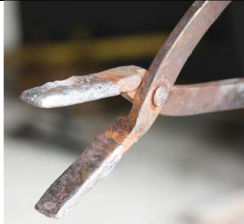
Tongs with soft welded copper on jaws