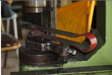
Fuller mounted in the power hammer