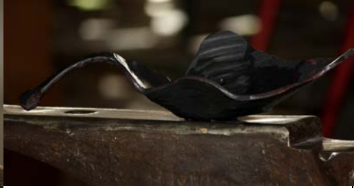
Bronze piece at end of demo.