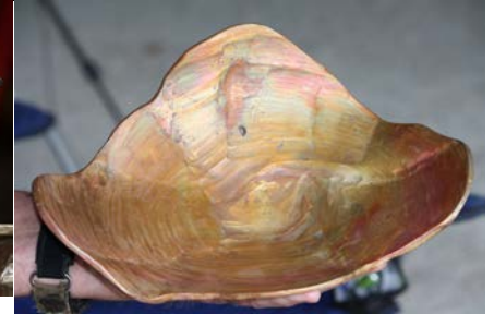
Example of Odd Shaped Bowl