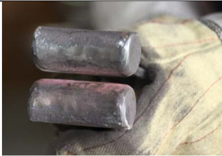
Fuller rounded two ways