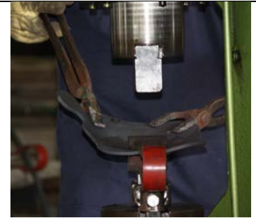
Working the piece under PH