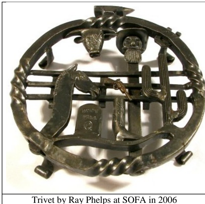
Trivet by Ray Phelps at SOFA in 2006