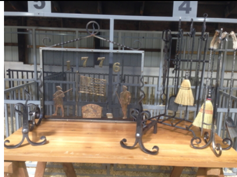
Winning fireplace set by Vernon Group