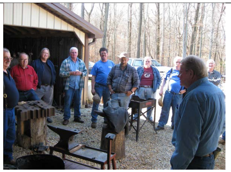
A beautiful day for Rocky Forge meeting in November.