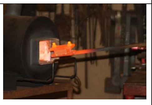
Forge welding in gas forge.