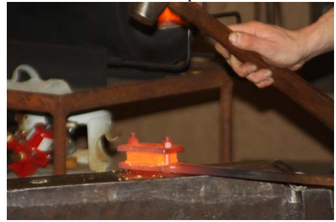
30 layers of copper and brass being forge welded in a special holder. The layered ingot can then be shaped in various ways to get a desired final pattern.