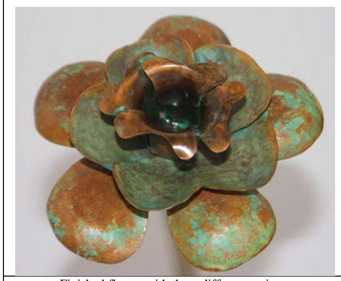
Finished flower with three different patinas.