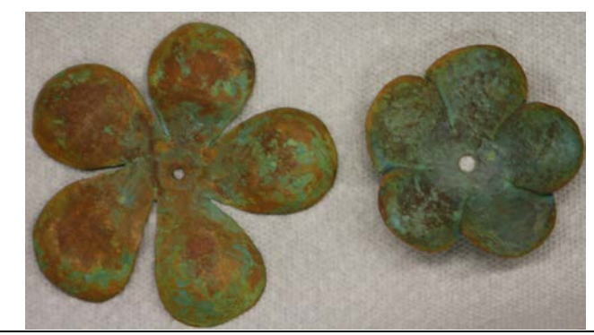
Upper side. Blue-green patina was used on the right.