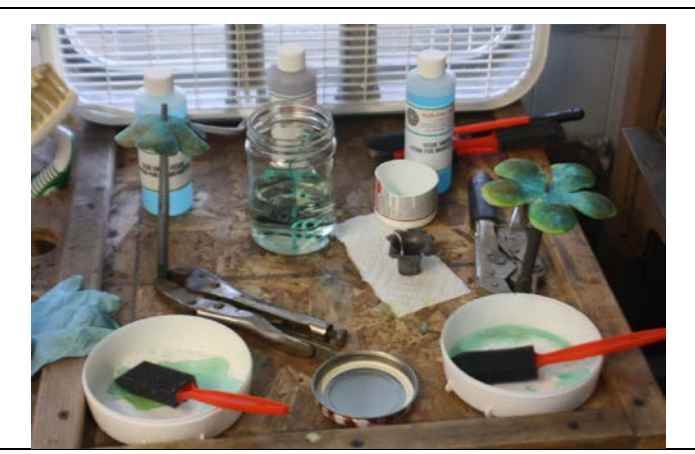
Shop "chemistry lab" with fan, open window and gloves.

To safely apply chemicals that cause patinas you need the right chemicals and a safe place to apply them without hurting yourself. The figure below shows the corner of my shop that I converted into a "chemistry lab". Note the fan and open window required to insure adequate ventilation.