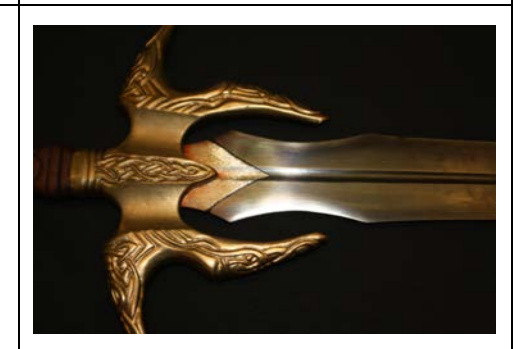
Sword from the movie "Thor".