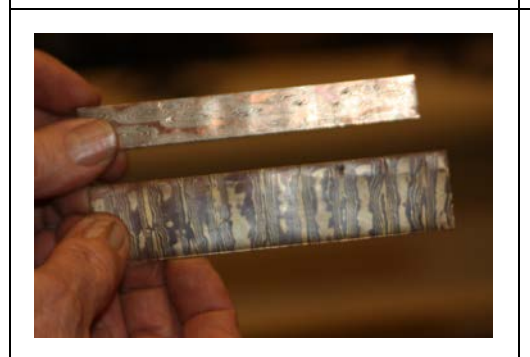
Different patterns from this process.