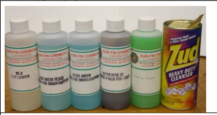
An array of chemicals and metal cleaners.

I bought a "Patina Sample Kit" of chemicals in 6 oz. bottles from the Sur-Fin Chemical Corporation for $95 (Reference 3). This consisted of 6 different patinas, 2 lacquers, and a metal cleaner (Brush N. Clean). The products I used for this article are shown in the following photograph.