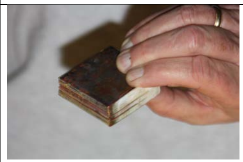
The finished 2"x2" fused ingot.