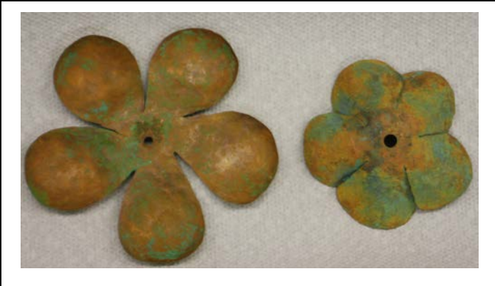
Lower side of petals. Green patina was used on the left.