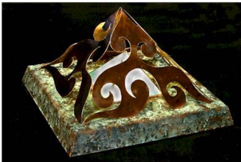
Chaz's Pyramid Light