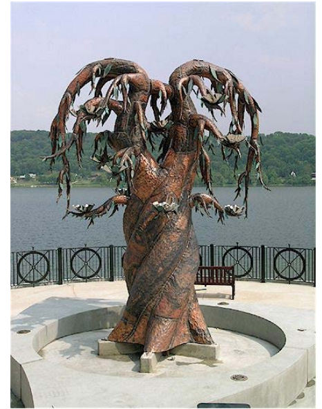
Chaz's Fountain tree for the City of Rising Sun, IN