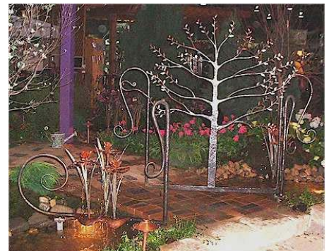
Beech Tree Gate made by Chaz.