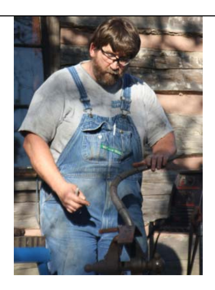
First get the basic shape with the main antler.