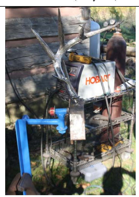
Add texture with special hammer and abrasive cutting wheel.