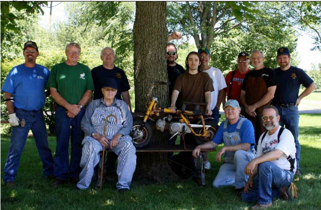
Rocky Forge members with sacrificial scooter at the June meeting of 2010. So this is what summer looks like!

Web Site: http://www.rockyforge.org/ (previous newsletters can be found here).